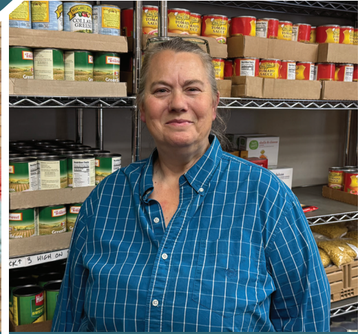
KEARNEY JUBILEE CENTER, BUFFALO COUNTY, NE