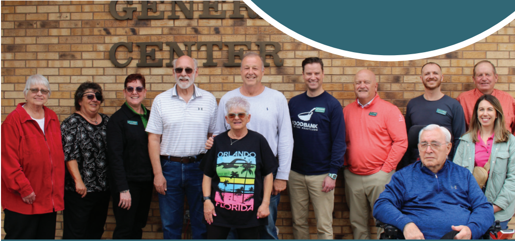
COZAD HAYMAKER GRAND GENERATION CENTER, DAWSON COUNTY, NE