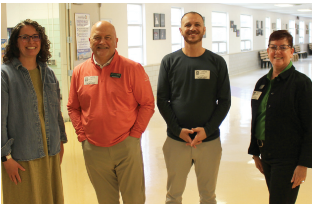
GRAND ISLAND PUBLIC SCHOOLS, HALL COUNTY, NE