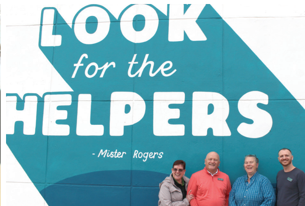
KEARNEY JUBILEE CENTER, BUFFALO COUNTY, NE

Your support is more vital than ever. Give now!