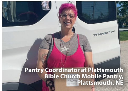
Pantry Coordinator at Plattsmouth Bible Church Mobile Pantry, Plattsmouth, NE