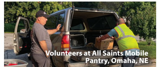
Volunteers at All Saints Mobile Pantry, Omaha, NE