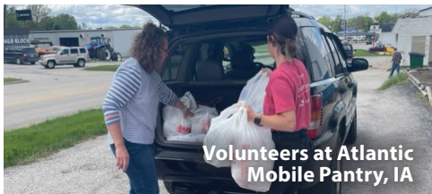
Volunteers at Atlantic Mobile Pantry, IA

Founded in 2012, the Food Bank's Mobile Pantry Program delivers food directly to communities that have a high need but limited food resources. These one-day distributions are free and include a variety of shelf-stable and perishable products, including fresh produce and bakery items. No identification is required to obtain food.