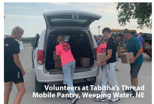
Volunteers at Tabitha’s Thread Mobile Pantry, Weeping Water, NE