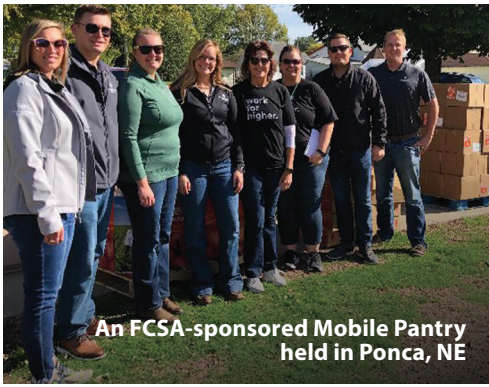
An FCSA-sponsored Mobile Pantry held in Ponca, NE