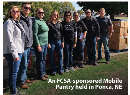
An FCSA-sponsored Mobile Pantry held in Ponca, NE

The Food Bank is grateful for the support we receive from individuals, foundations, and corporate partners. Farm Credit Services of America is just one example of a dedicated supporter in the fight against hunger. For the last decade, FCSA has sponsored various Mobile Pantries in rural communities across the Food Bank's service area—helping distribute food to thousands of Heartland neighbors, while also providing financial support to the Food Bank to purchase the food that is distributed.