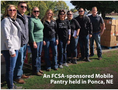
An FCSA-sponsored Mobile Pantry held in Ponca, NE