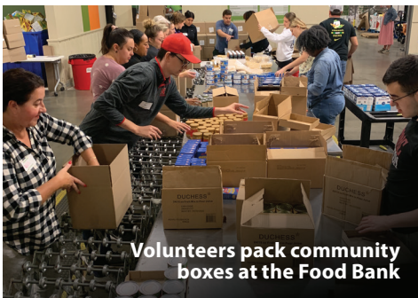
Volunteers pack community boxes at the Food Bank